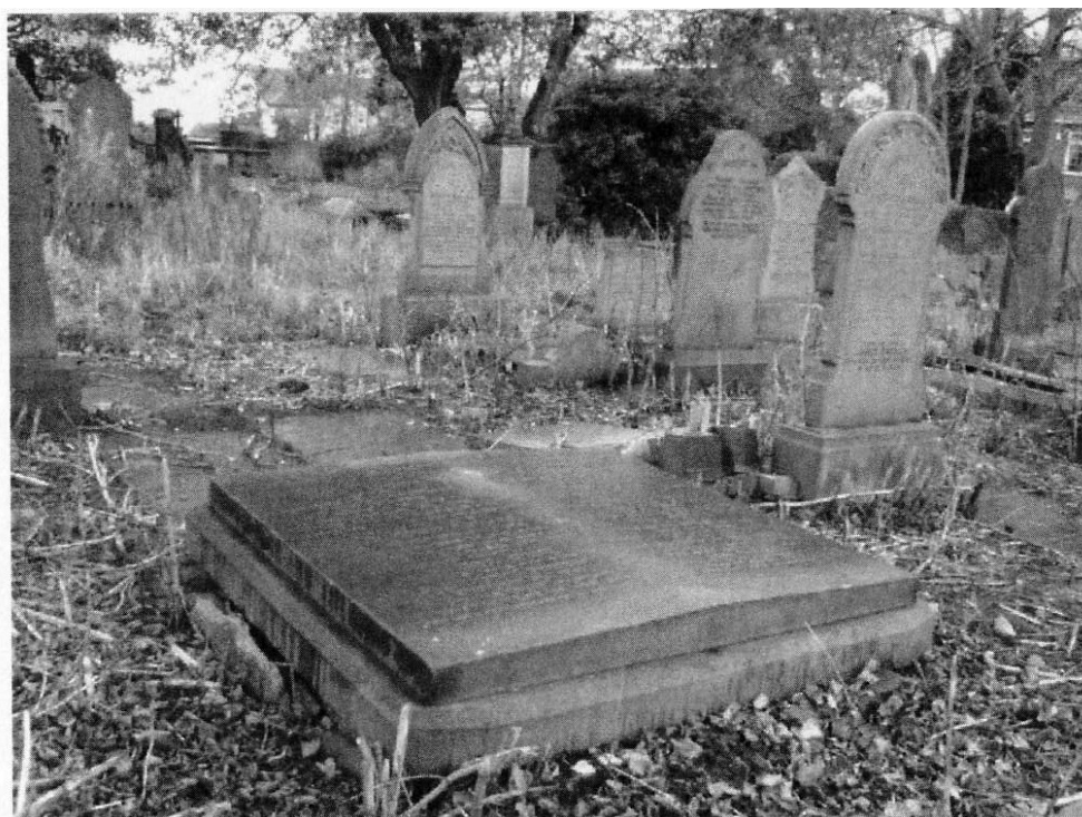
The Bradbury and Tomlins Grave at The Old Chapel - Dukinfield

Charles Timothy Bradbury is buried at Old Chapel, Dukinfield a huge double slab.